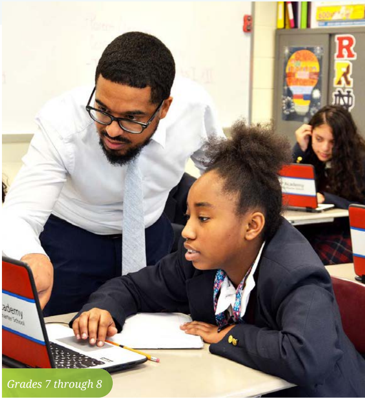
Grades 7 through 8