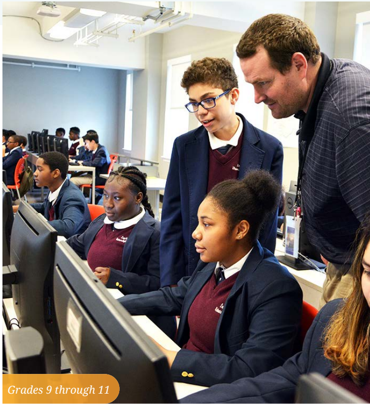
Grades 9 through 11